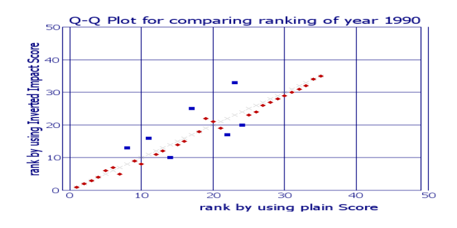
Fig. 1. Comparison of the ranking for year 1990.

In all q-q plots that compare I-Impact Score ranking (either Weighted or Plain) and Score ranking (either Weighted or Plain) (Figures 1, 2a, 2b), there are some outliers (marked as blue squares in the graphs), for which x \ll y , meaning that they have much better rank position by using Score than I-Impact Score. This is due to the nature of the Impact Score notion, where only citations made in the next k (2 in our tests) years are taken into account. Thus, these specific conferences do not have big "Impact", meaning that do not have a lot of citations during the next 2 years, but they have citations until "now".